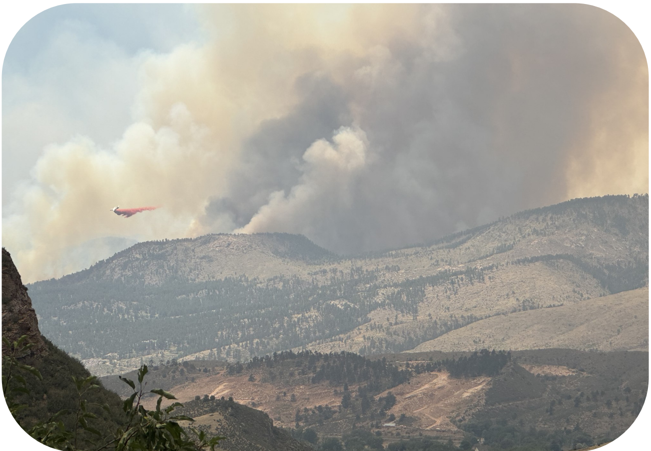
Photo: Alexander Mountain Fire August 2024

Stay tuned for updates as we move toward completing the WRAP by the end of 2024, boosting our preparedness and ensuring a safer, more resilient future for the Big Thompson watershed.