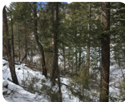
Breakiron Restoration Project Before Photo Spring 2021

The Breakiron project is located approximately two and a half miles northeast of Drake, CO in the Cedar Park subdrainage which feeds into the Big Thompson. This project consists of a forest restoration treatment of 32 acres that borders the Arapaho Roosevelt National Forest in the Storm Mountain Area. Peaks