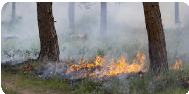
Magic Feather Prescribed Burn

We're proud to announce we have provided funding support for Fireforest , a new multimedia project exploring forest fire and restoration in northern Colorado. We all rely on healthy forests for our water, but this year, we saw our waterways turn black with sediment from the Cameron Peak Fire. Our forests have become prone to megafires and desperately need our help to restore their resilience. Fireforest is raising support for those efforts by showing the relationship between water, forests, and fire in new and fascinating ways. Learn more about this exciting project at https://www.fireforestphoto.com/ .